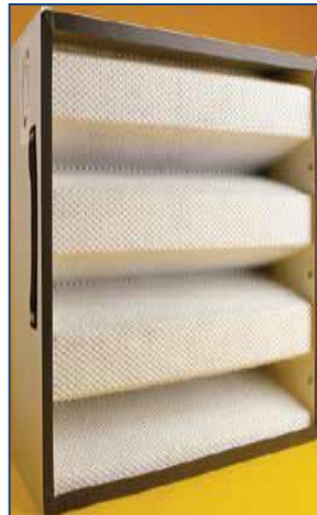
BSM max Filter