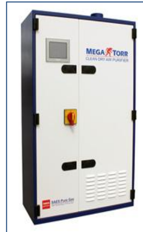
Clean Dry Air Purifiers (PS-22-MGT-XXX)